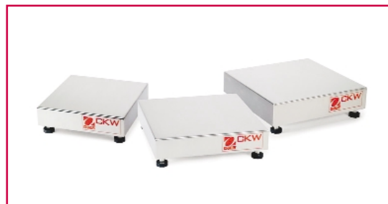
4 x capacity models in 3 base sizes