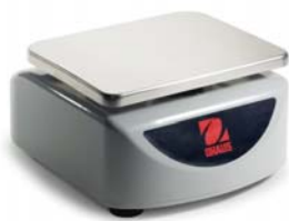
BW Series - Rear View