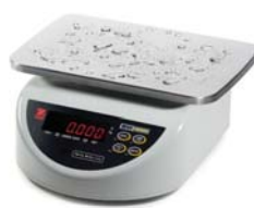
BW Series - Large Pan Accessory