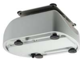
BW Series - Bottom View