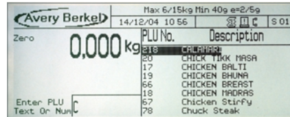
Informative dot matrix display. Example shows PLU search mode

The full dot matrix display ensures easy operation - and the perfect medium to communicate customer messages and promotions.