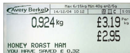
Promotional offers clearly displayed

The M601 has ample data storage capability for even the largest labelling operation - with option for expansion for up to 10,000 PLUs.